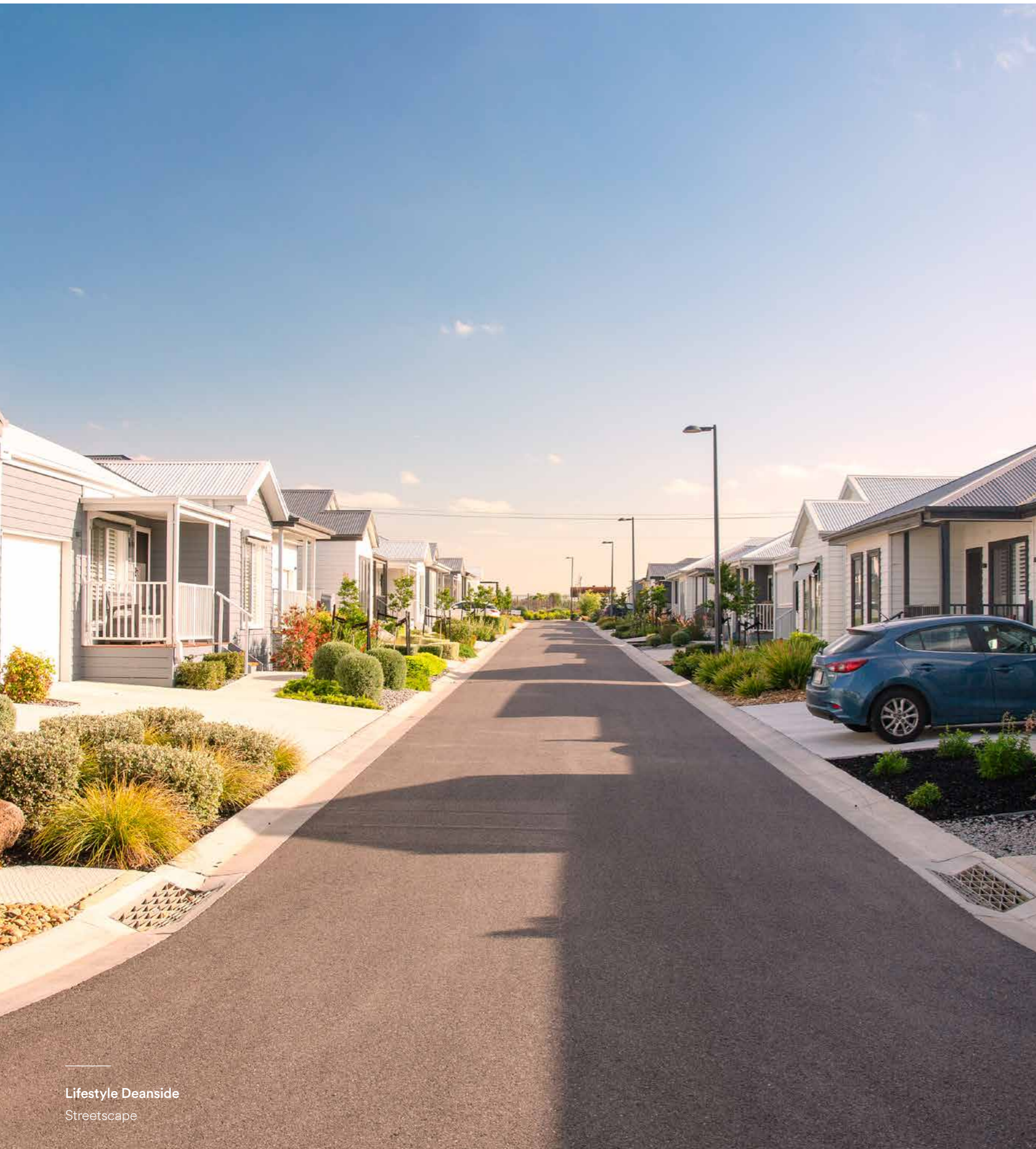
Lifestyle Deanside Streetscape