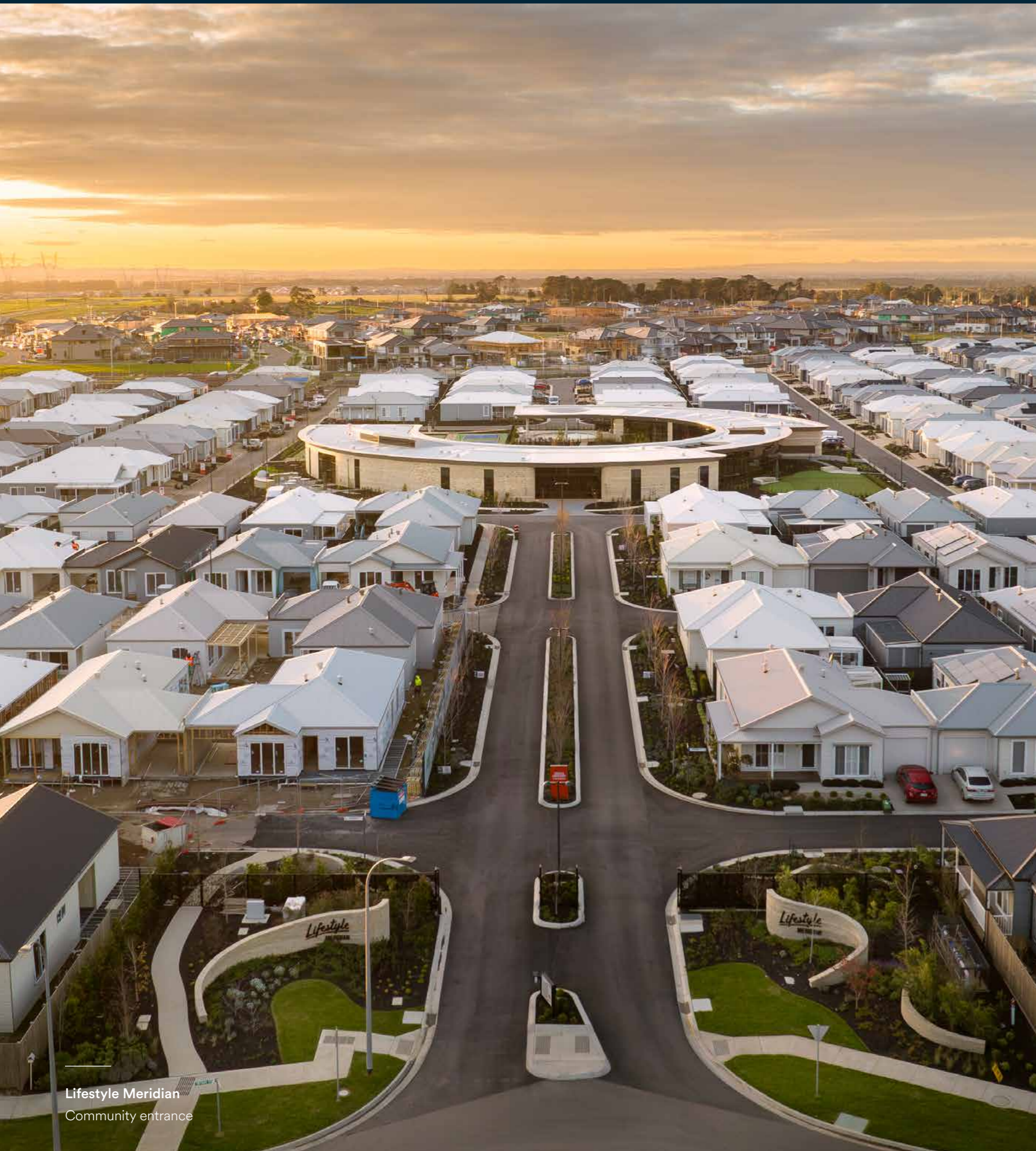
Lifestyle Meridian Community entrance