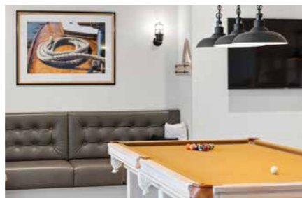
Engage in a friendly game of billiards with mates