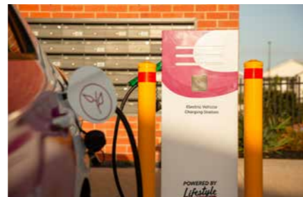
Free use of an electric car and charging station