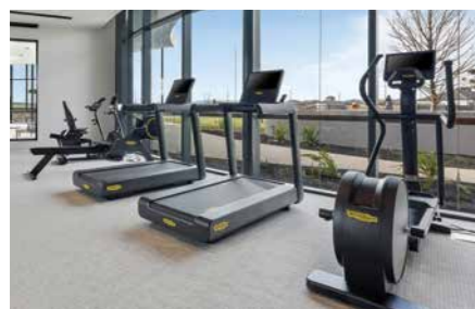
Achieve your fitness goals in our well-equipped gym