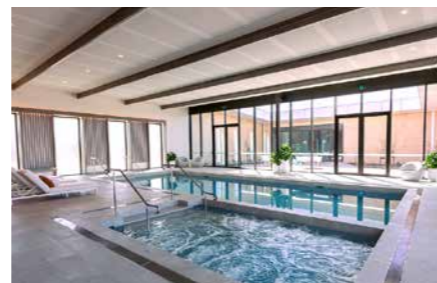
Indulge in ultimate relaxation in the luxurious spa