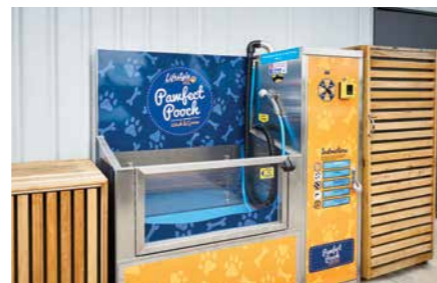
Treat your furry friend to a spa day at the dog wash