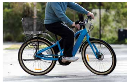
Enjoy a leisurely ride on the electric bikes