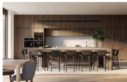
Host a sizzling BBQ with friends at the BBQ area