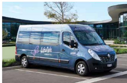
For group adventures, enjoy our convenient shuttle