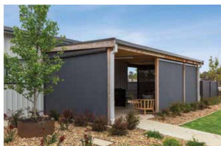
Unleash your creativity in the maker's studio