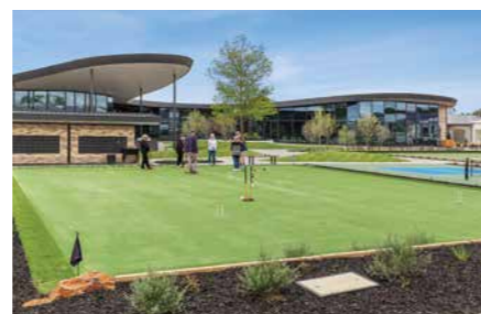
Perfect your swing on our pristine croquet court