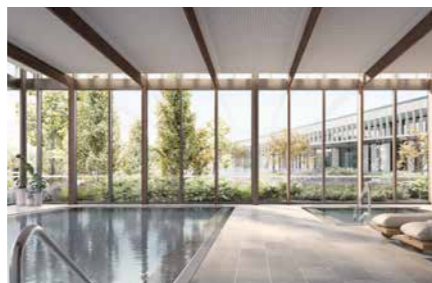
Take a dip in the indoor pool