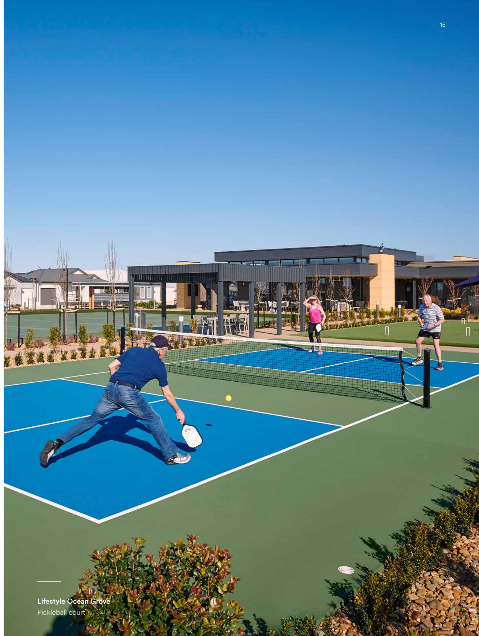
Lifestyle Ocean Grove Pickleball court