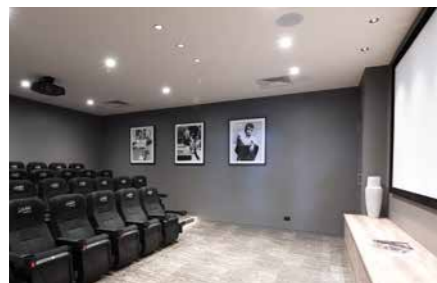
Immerse yourself in a blockbuster movie in the cinema