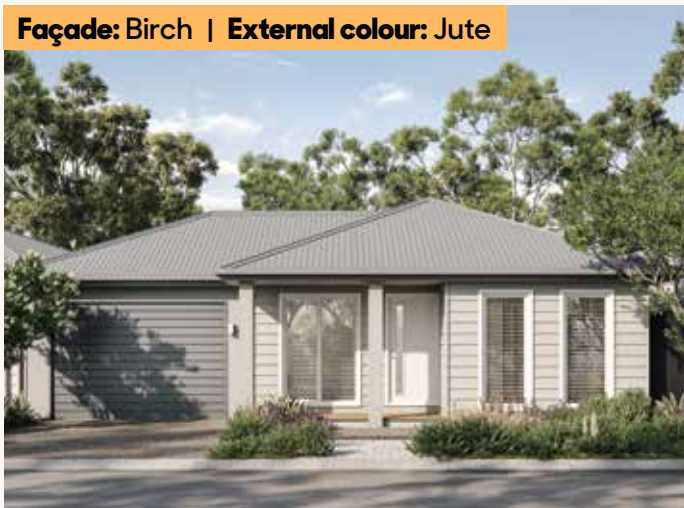
Façade: Birch | External colour: Jute