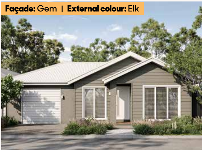
Façade: Gem | External colour: Elk