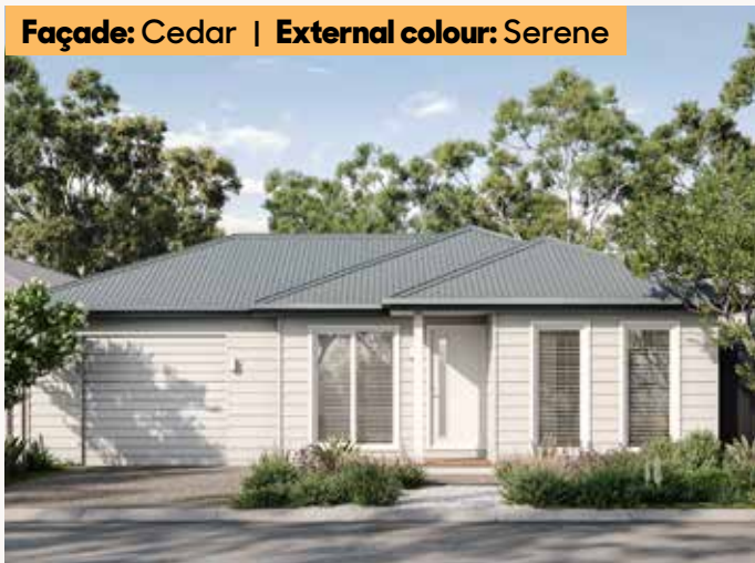
Façade: Cedar | External colour: Serene